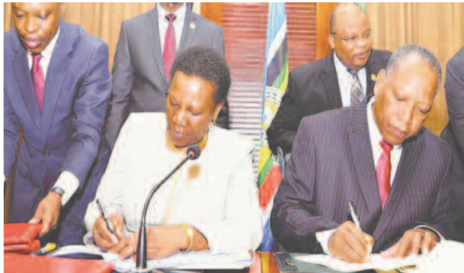
Tanzania's Minister for Constitution and Legal Affairs, Prof. Palamagamba Kabudi and Uganda's Minister for Energy, Eng. Irene Muloni, sign the framework agreement

T anzania and Uganda have signed a framework agreement for implementation of the 1,403 - kilometre pipeline project that will transport crude oil from Hoima in Uganda to the Tanzanian port of Tanga.